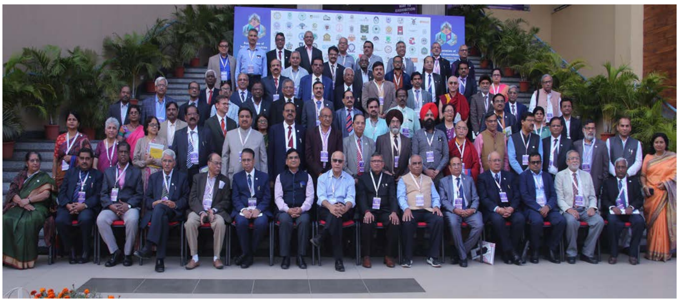
93 rd Annual General Meet and National Seminar on Autonomy for Excellence in Higher Education organized by Association of Indian Universities on 16 th – 18 th February 2019